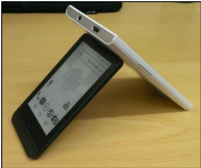
Figure 1. Top: A visual cue on social display about the activity a user is doing with the mobile device. Bottom: physical design of social display. A hinge enables the user to hold the phone without covering the display